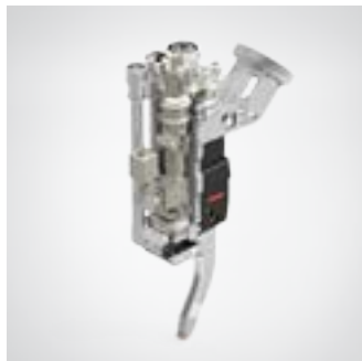
6 KW ULTRAKOMPACT TWIN