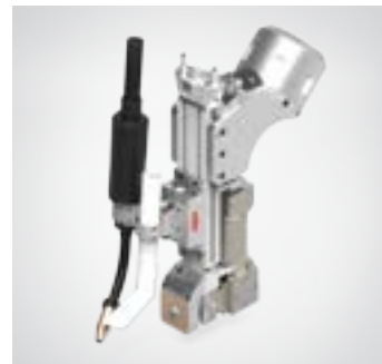
10 KW FILLET WELDING HEAD