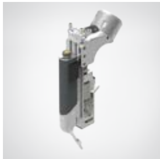
10 KW TPS/i WELDING HEAD