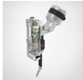
4 KW / 6 KW ULTRAKOMPACT