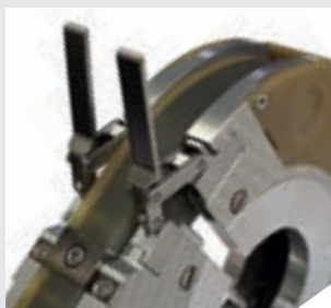
/ Spring loaded clamping system