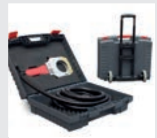
/ Transport case with trolley