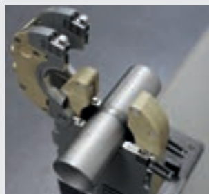
/ Perfect welds due to closed chamber