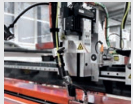
/ Weldhead with AVC/OSC slides