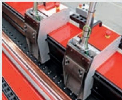
/ Adjustable pneumatic center stops