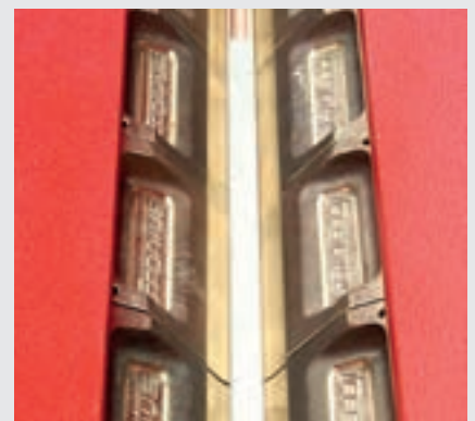
/ Adjustable clamping plates