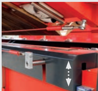
/ Height adjustable lower beam