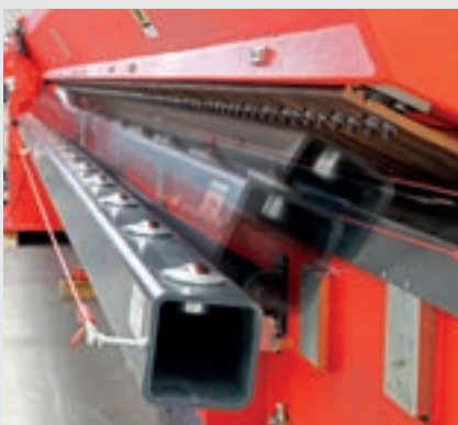
/ Supporting bar with rollers