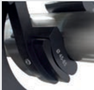
/ Reducer jaws depending on tube outer diameter