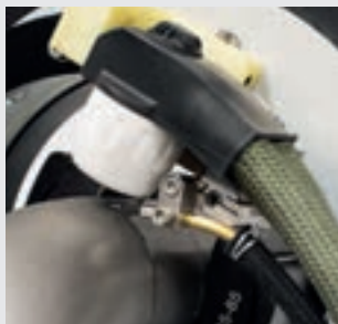
/ Wire feeding, torch bracket from 0 - 45° stepless swivelling