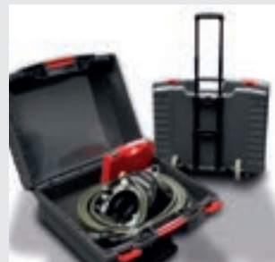
/ Transport case with trolley