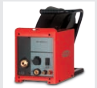
/ Wire feeder KD 4000 D-11