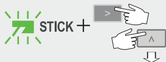
Setup menu - MMA welding