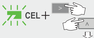
Setup menu - Cel electrodes