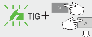
Setup menu - TIG