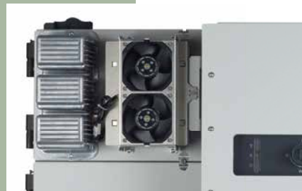
Replaceable power stage set